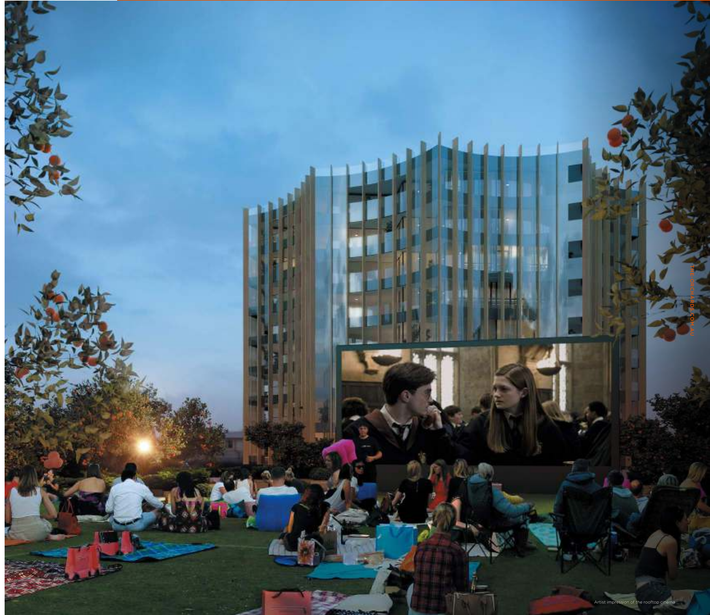
Artist impression of the rooftop cinema

There's nothing like movie nights under the stars. Indulge in starry entertainment at The Orchards rooftop cinema. Leave your car keys behind, grab your picnic blanket.