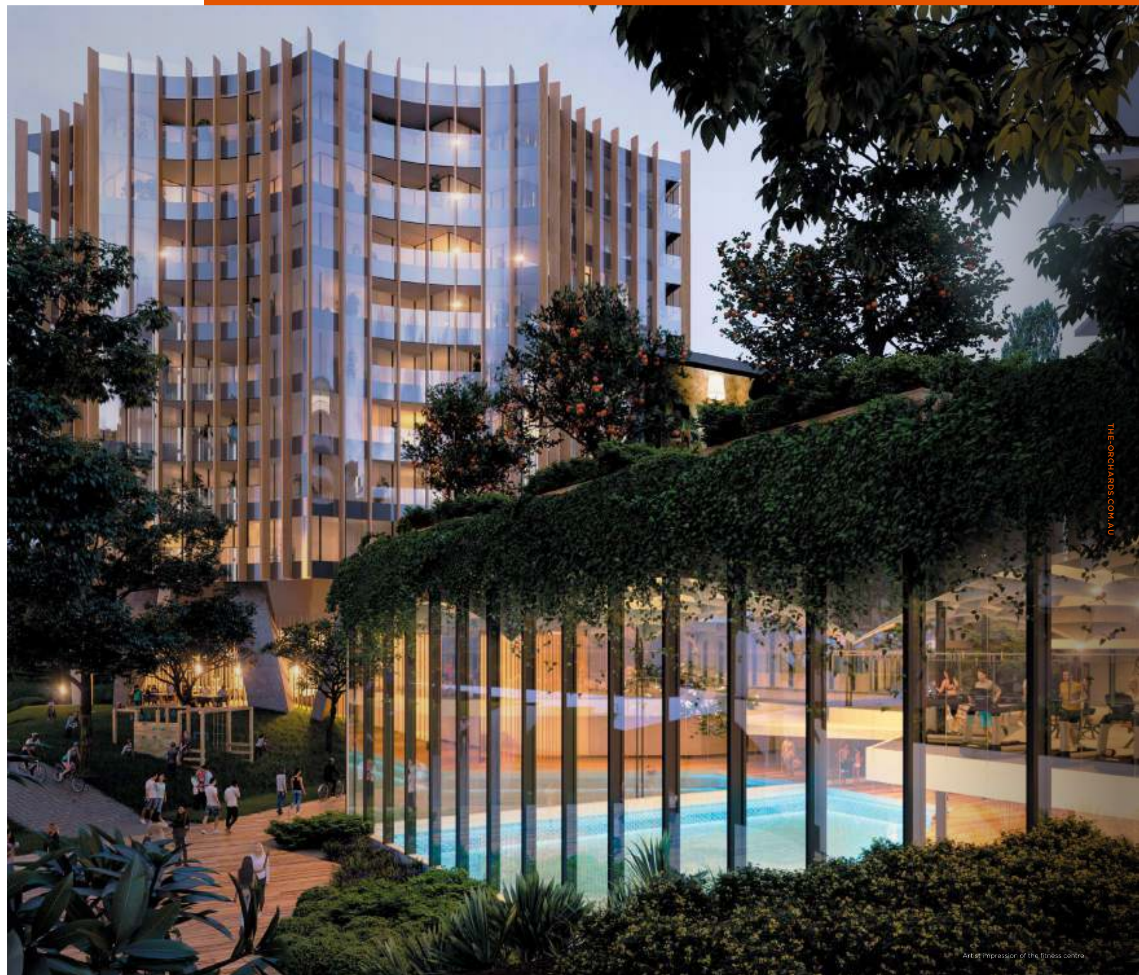
Artist impression of the fitness centre

Pilates, Yoga, Gym? The Orchards has got you covered. Your world class wellness centre and indoor lap pool is surrounded by lush gardens and mature citrus trees.